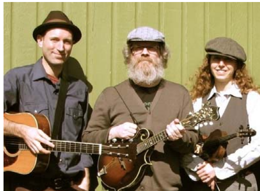
The Quickdraw String Band